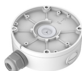
JUNCTION BOX IR-V-BKT-JB-02