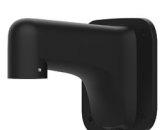
WALL MOUNT IR-V-BKX-WAL-01B