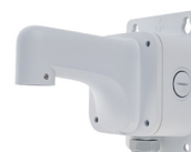
WALL MOUNT IR-V-BKX-WAL-02