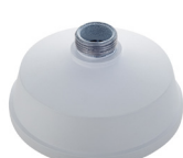
PENDANT CAP IR-V-BKT-ADT-02