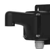
WALL MOUNT IR-V-BKX-WAL-02B