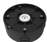
JUNCTION BOX IR-V-BKT-JB-02B